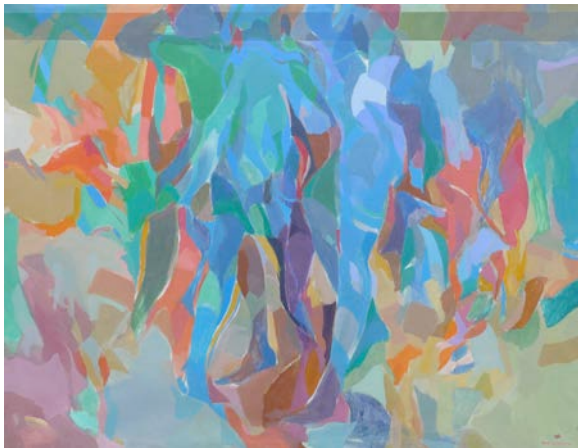
Khalil Ibrahim, Fisherman/ Man in Motion (1992) acrylic on canvas, 98.5 x 127 cm Est: S$ 12,000 - 16,000

Leading the Malaysian art section is Khalil Ibrahim's Fisherman / Man in Motion , depicting a scene of various human forms in a flurry of activity. The silhouettes in the foreground are painted in a Cubist style, no doubt influenced by his study in London during the 60s.