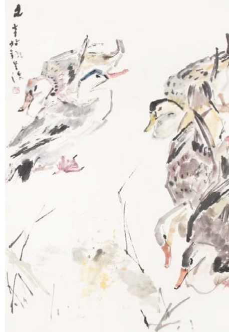
Chen Wen Hsi, Water Ducks (c.1970s) ink and colour on paper, 66 x 44 cm Est: S$ 40,000 - 60,000