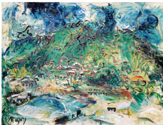
Affandi, Mountain Village (1967) oil on canvas, 76 x 101 cm Est: S$ 100,000 - 150,000

A much-respected modern artist, Affandi is completely honest in his paintings, never obnoxious; he paints his subjects in their natural. This auction features two of his paintings from this period - 'Mountain Village' and 'Horse and the Sun'.