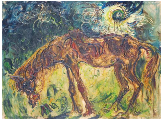
Affandi, Horse and the Sun (1973) oil on canvas, 97 x 128 cm Est: S$ 200,000 - 260,000

The 'Horse and the Sun' is an exquisite piece that not only highlights Affandi's talent as a naturalist but also as an expressionist with the unique technique of painting directly from the tube. The strong colours as well as the shape of the sun and horse is signature of Affandi's style and was featured in a three - volume autobiography of the artist.