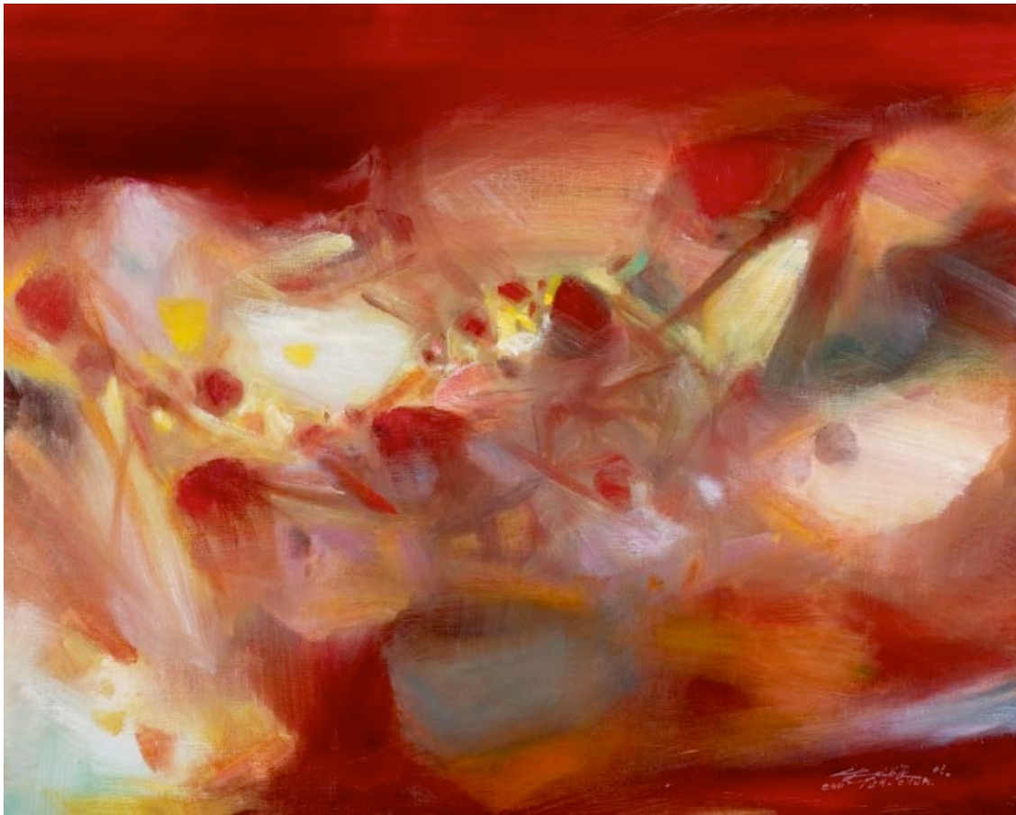
Zhu Dequn, Germinations (2006) (Estimate: S$ 280,000 - 350,000)