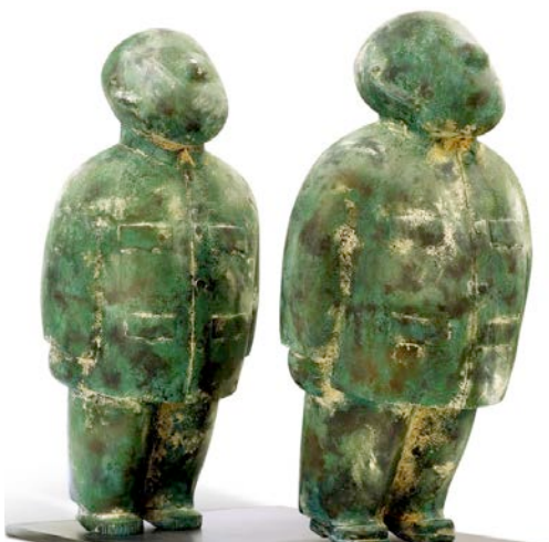
Zhu Wei, China-China No 2 , Estimate S$100,000 – 150,000, (Lot 124)